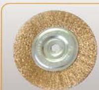
Brush Wheel Optional 可选钢丝轮