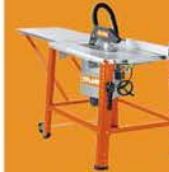
TABLE SAW 台锯